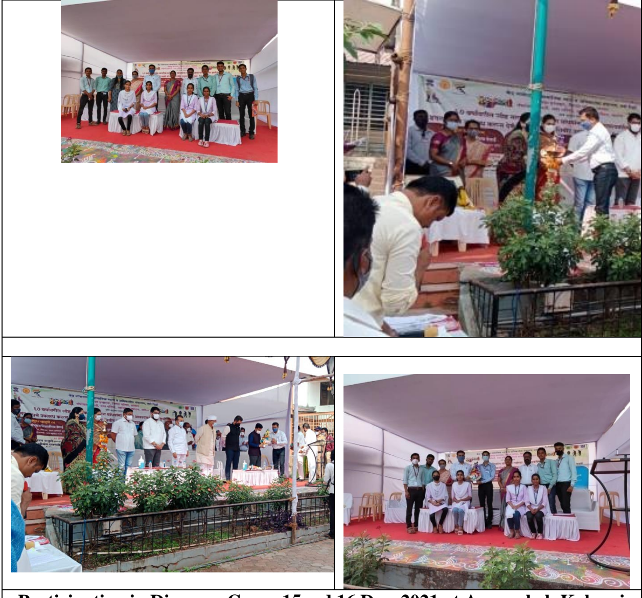
Participation in Diwyang Camp 15and 16 Dec. 2021 at Annasaheb Kalyani Vidyalaya, Satara